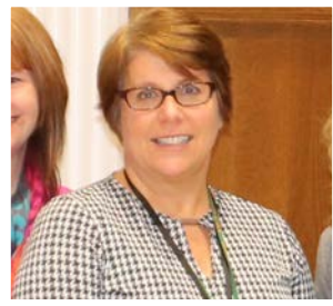
November Proud to be MACS Honoree