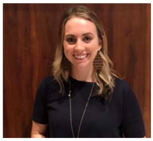
October Proud to be MACS Honoree