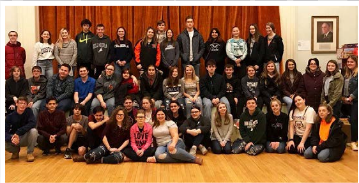
Students at Mexico High School recently volunteered their time after school to help the First Presbyterian Church in Mexico with their annual Operation Reindeer efforts. The students packed more than 400 children's bags to help bring joy to 147 families this holiday season.